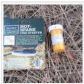
Add a Cheap, Reliable Firemaking System to Your Survival Kits