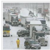
Gov. declares winter preparedness day