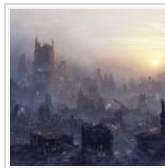
Class War Survival Tips: Gun Shopping Guide