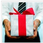
What Do You Get The Person Who Already Has Everything?